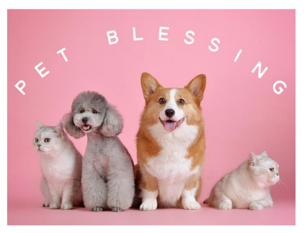
OCTOBER 9 AT 1PM

Join us at 1-1:30pm on October 9 in the parking lot of the church for our annual blessing of the pets! You may bring your animals in person or simply bring photos for the blessing.